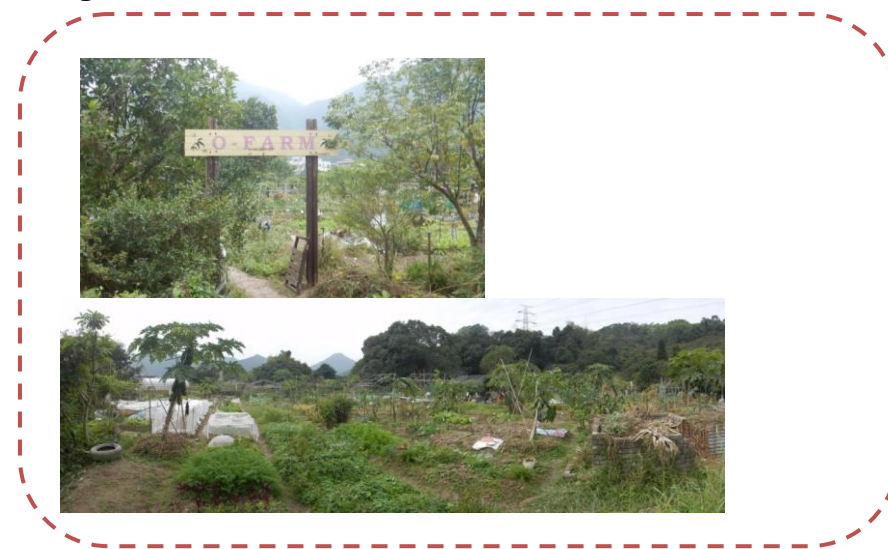
Figure 7: O-Farm

2.27 O-Farm was established in 1999. The farm is situated at Hok Tau with an area of about 1 hectare. O-Farm is an organic farm promoting the concept of permaculture* ( Figure 7 ). (16) The farm is open to the public every Saturday and Sunday. Farmland rental programme is available for the public to gain experience in organic farming. Farming tools, organic fertiliser, seedlings, irrigation services and technical support are provided to participants. In addition, community projects are organised by O-Farm to promote the concept of permaculture, such as organising organic farming programme in primary schools.