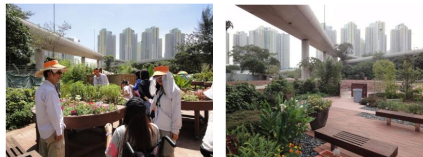
Figure 5: Urban Oasis

2.19 The farm mainly comprises a planting area and a horticultural therapy garden (i.e. Serene Oasis). A variety of flowers, herbs and crops are grown by organic farming methods. It is primarily staffed by volunteers. The farm plots are rented out on a seasonal or monthly basis by charging members a small fee to sustain the operation. (Figure 5)