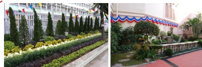
Figure 2: Greening Schools Subsidy Scheme