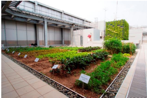
Figure 6: Hysan Urban Farm